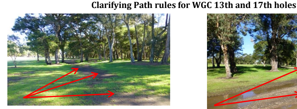
WGC - 13th Hole – bare patches in the trees are not official cart path or road - No free drop – integral part of the course.

Are measured to centre of greens: Blue - 200m White - 150m Yellow – 100m Red - 50m