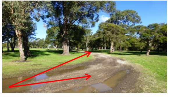
WGC - 17th Hole – Free drop . Road built for maintenance vehicles.